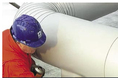
* Compared to traditionally used insulation and cladding systems